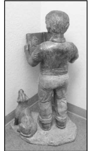
In "time out"