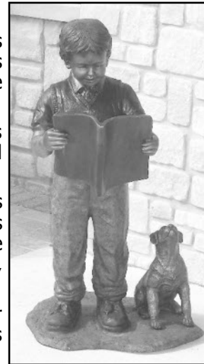
At the entrance

But, library officials promise: "they will return".